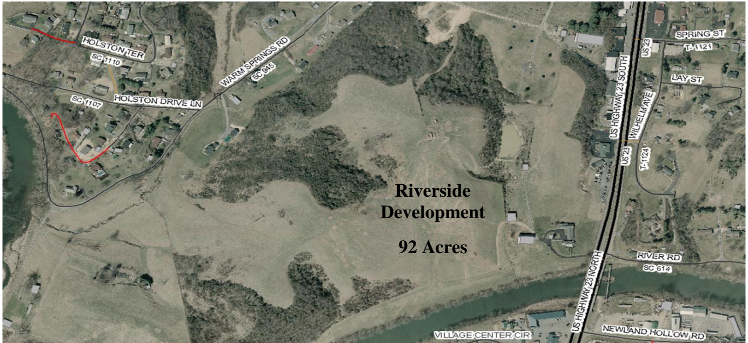
Riverside Development 92 Acres